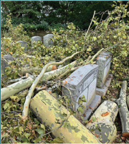
Tree damage, fallen tree, & aggressive tree roots.