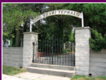
Top: Hebrew Fraternity Cemetery in Hopelawn, NJ. Bottom: Congregation Shaarey Tefilah Cemetery in Perth Amboy, NJ

Very few people appreciate the complexity of cemetery ownership, management, and maintenance, and most underestimate the true costs involved, especially long-term. Most cemeteries owned by synagogues and fraternal lodges underestimated what expenses would be in future years and failed to prepare adequately for them. This was true in the early 20th century and is still true today.