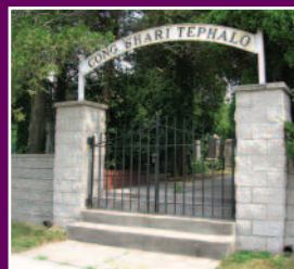
Top: Hebrew Fraternity Cemetery in Hopelawn, NJ. Bottom: Congregation Shaarey Tefiloh Cemetery in Perth Amboy, NJ