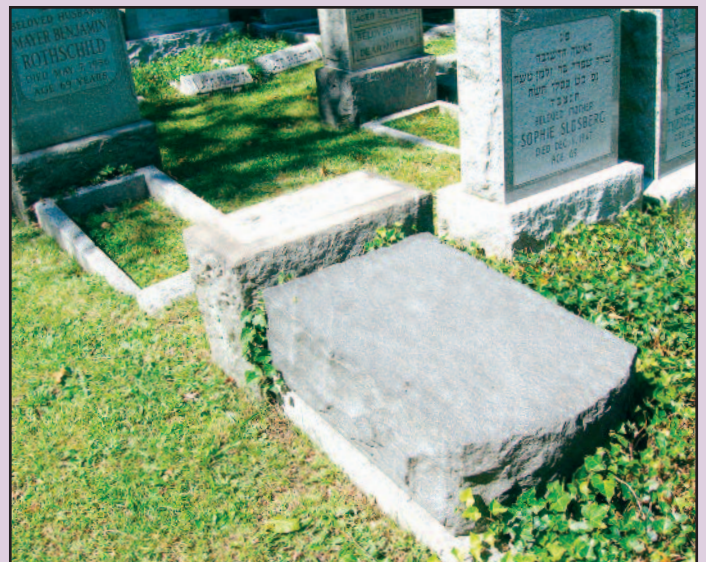
Repairing toppled monuments is very expensive.