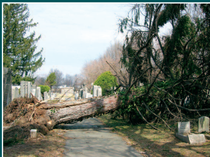
Donations have helped to repair weather-related damage from fallen trees and branches.