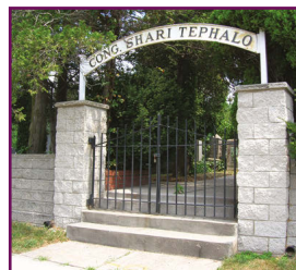
Top: Hebrew Fraternity Cemetery in Hopelawn, NJ. Bottom: Congregation Shaarey Tefiloh Cemetery in Perth Amboy, NJ