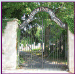
Hebrew Fraternity Cemetery in Hopelawn, NJ