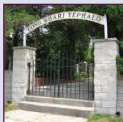
Congregation Shaarey Tefiloh Cemetery in Perth Amboy, NJ