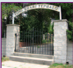
Bottom - Congregation Shaarey Tefilah Cemetery in Perth Amboy, NJ

We receive many requests for information about family ancestry and connections from people who know that our cemeteries hold many of the needed answers. In addition, we often receive requests for the names of descendants --- sometimes for bequests and other rewards. Unless family members have revealed their connections to us -- including updated contact information --- we are unable to identify or locate most descendants of those interred at our cemeteries. This problem increases with passing time and generations.