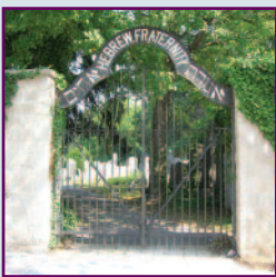
Top - Hebrew Fraternity Cemetery in Hopelawn, NJ