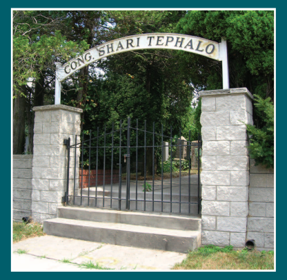
Congregation Shaarey Tefiloh Cemetery in Perth Amboy, NJ