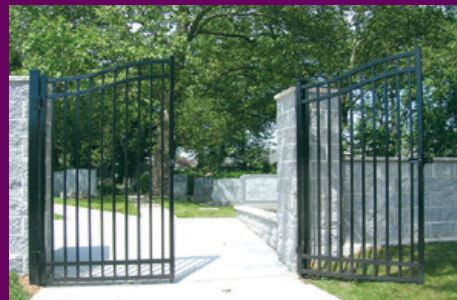
Clockwise from top: Entry gates of Hebrew Fraternity, Bingle Street, and Shaarey Tefiloh