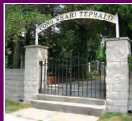
Top: Hebrew Fraternity Cemetery in Hopelawn, NJ. Bottom: Congregation Shaarey Tefilah Cemetery in Perth Amboy, NJ