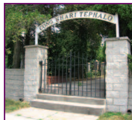
Top: Hebrew Fraternity Cemetery in Hopelawn, NJ. Bottom: Congregation Shaarey Tefilah Cemetery in Perth Amboy, NJ