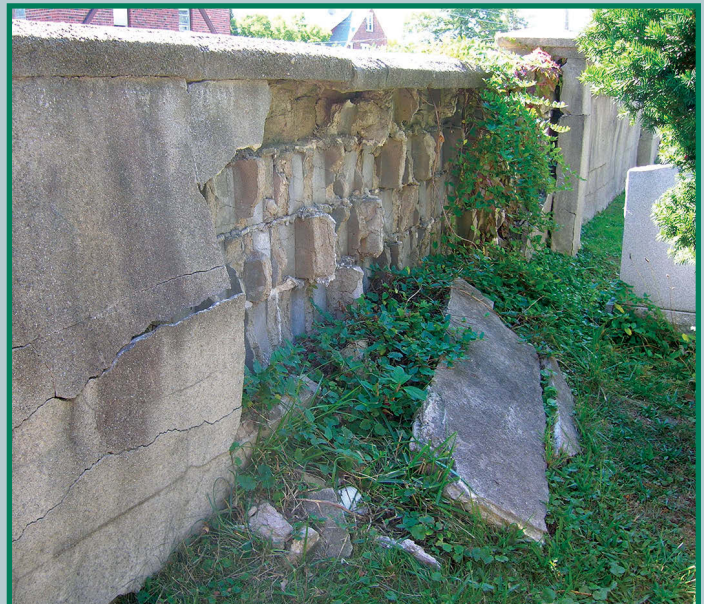
Bingle Street Cemetery wall in need of repair