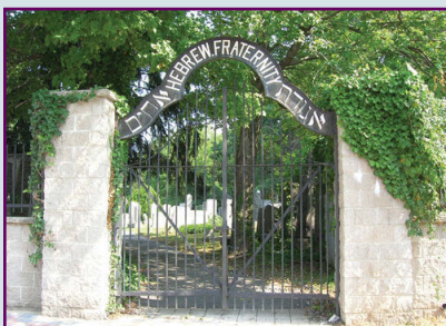
Hebrew Fraternity Cemetery in Hopelawn, NJ