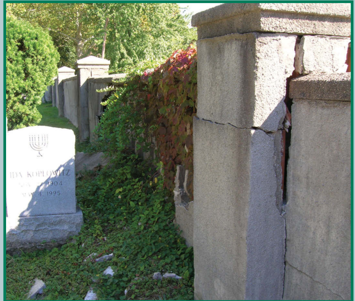
Bingle Street Cemetery wall in need of repair