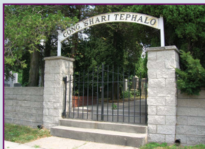
Congregation Shaarey Tefilah Cemetery in Perth Amboy, NJ