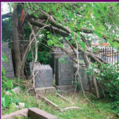
Fallen tree branches at Hebrew Fraternity Cemetery

In late June, several large branches of an otherwise healthy mulberry tree fell in a crowded section of our Hebrew Fraternity Cemetery, threatening all graves in the area. We were very fortunate that prompt attention and careful removal of the tree prevented damage to any nearby monuments. However, this event reminded us again that we must be prepared --- both physically and financially --- for unexpected natural disasters, which can add significantly to cemetery maintenance expenses.