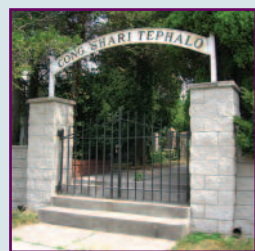
Congregation Shaarey Tefilah Cemetery in Perth Amboy, NJ

Cemetery management requires much more than selling plots, arranging burials, mowing grass, and trimming weeds --- all of which involve expected and inflationary expenses. Like any other property, every cemetery is subject to weather-related damage (storms, flooding, droughts, etc.), age-related degradation (of walls, walkways, roads, etc.), and vandalism. In the past few years, we have seen all of these, and we know that the costs of these repairs were never anticipated in the original budgets of our cemetery founders. In previous issues of our newsletter, we have presented images of enormous fallen trees and other storm-induced damage.