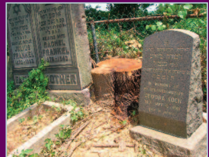
Tree stump and surrounding graves following careful removal of the tree