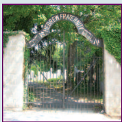
Hebrew Fraternity Cemetery in Hopelawn, NJ

Very few people understand the complexity of cemetery management and maintenance, and --- regrettably ---- most people grossly underestimate the true costs involved. Most managers of cemeteries owned by synagogues and fraternal lodges underestimate long-term expenses and fail to prepare adequately for them. This was certainly true in the early days of our cemeteries, and it is still true today.