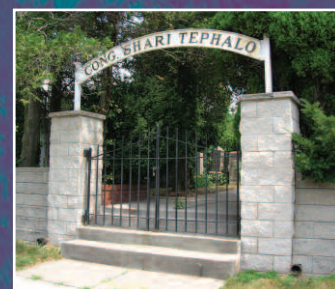
Left - Hebrew Fraternity Cemetery in Hopelawn, NJ