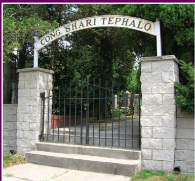
Congregation Shaarey Tefiloh Cemetery in Perth Amboy, NJ