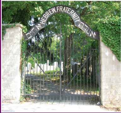
Hebrew Fraternity Cemetery in Hopelawn, NJ